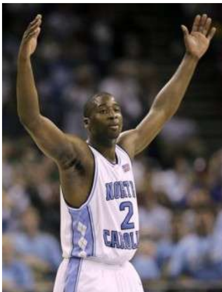
Ray Felton could be joining a team that lost 16 games by three points or less in Charlotte.

I truly believe this is where the draft really begins. Charlotte knows one of the three marquee point guards - Deron Williams, Chris Paul, or Raymond Felton - will be available. Most likely the PG on the board is Felton, a Carolina favorite obviously. Brevin Knight was serviceable, ranking near the top in assists this past season. Although, Knight played well, he doesn't possess scoring ability and really has not had back-to-back good seasons since entering the league in Cleveland years ago. Bernie Bickerstaff's Bobcats are contemplating whether to trade up or not. Staying put gives them the option of taking Gerald Green or Danny Granger, then drafting Sean May perhaps at #13. Finally, a match made in heaven is Villanueva joining old UCONN teammate Emeka Okafor.