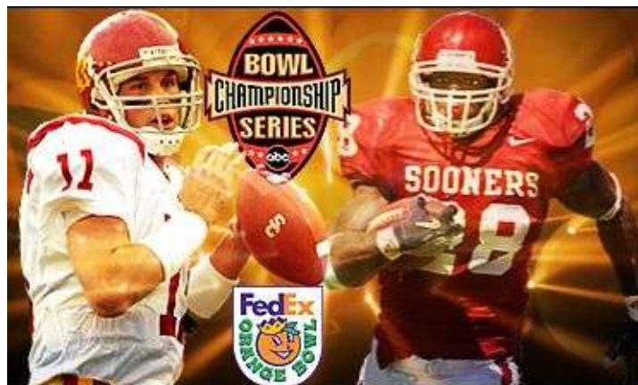
Southern Cal faces Oklahoma for all the marbles in the FedEx Orange Bowl.